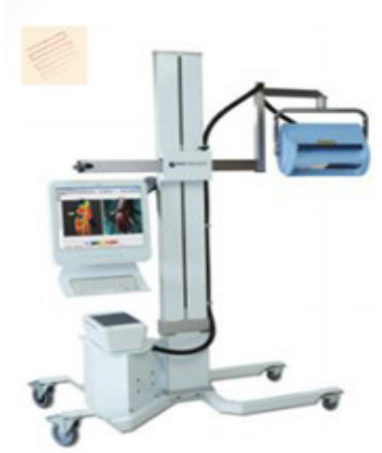
Fig. 1 - Laser Doppler Imager machine

This machine is a laser doppler imager and it takes a picture of your burn showing the amount of blood flow in the skin.